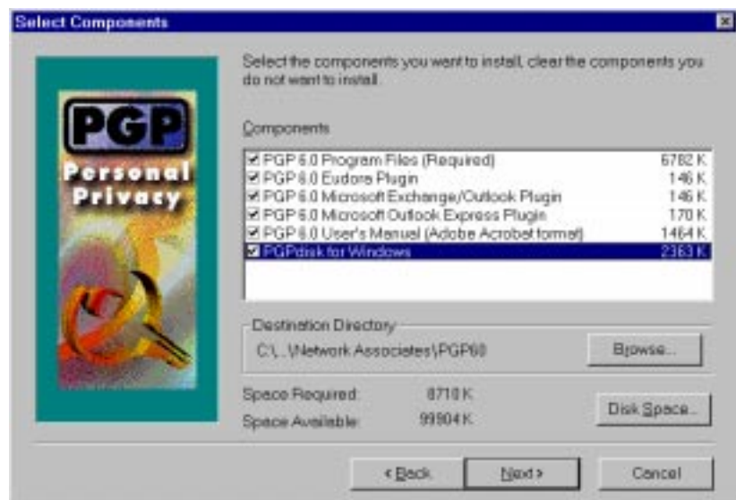
Figure 2-1. PGP for Windows Select Components dialog box

The Select Components dialog box appears, as shown in Figure 2-1 .