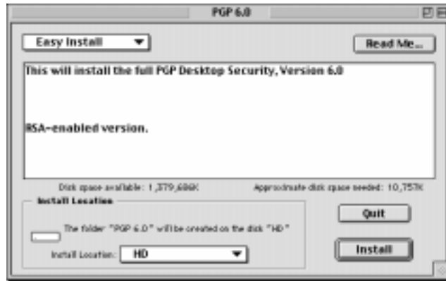
Figure 2-2. PGP for Macintosh Installation screen

The installation screen appears, as shown in Figure 2-2 .